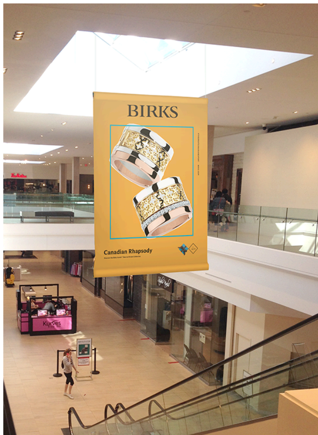
DIGITAL DISPLAYS, SPECIALTY MEDIA

Economic growth in the northeastern sector of Edmonton has made Londonderry Mall ideally situated to attract high-income professionals, tradespeople and their families. Canada's first free-flowing ring road, Anthony Henday Drive, is located mere minutes from the centre, moving Edmontonians and visitors around the city like never before. Currently anchored by Hudson's Bay, Save On Foods, Winners and La Maison Simons.