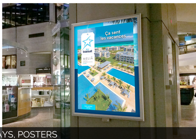
DIGITAL DISPLAYS, POSTERS