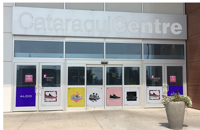
SPECIALTY MEDIA, DIGITAL DISPLAYS

Cataraqui Centre is the largest shopping centre in southeastern Ontario. With a variety of first to market retailers including H&M, Sephora, Bath & Body Works and American Eagle, Cataraqui Centre offers the trade area a complete shopping experience. Easy access to the centre is enhanced through a transfer point for Kingston transit. This two-level enclosed regional shopping centre captures the markets extending from Belleville, Ontario to the west, Ottawa, Ontario to the north and Montreal, Quebec to the east.