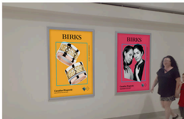
DIGITAL DISPLAYS, POSTERS

This family-orientated regional shopping centre is the destination of choice for suburban communities east of the Greater Toronto Area (GTA). Conveniently located just off Highway 401, shoppers can also take advantage of excellent public transit options offered by both Durham Region Transit and GO Transit, the latter of which connects commuters to the centre via a pedestrian bridge. Saks Fifth Avenue OFF 5TH, H&M and Hudson's Bay are a few of the centre's highly desirable retailers, while Jack Astor's Bar & Grill and Moxie's Grill & Bar entice visitors looking for quality dining options. Famous Players Theatre and Farm Boy Fresh Market are two more attractions that make Pickering Town Centre a unique and popular destination.