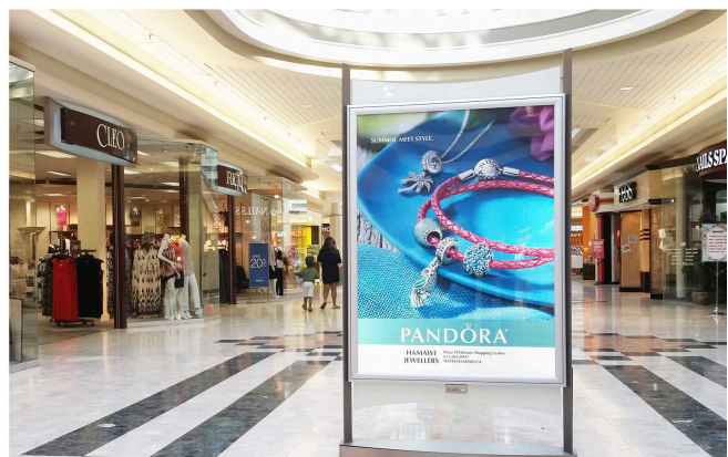
DIGITAL DISPLAYS, POSTERS

P lace d'Orléans has a surface of 756,300 square feet, with everything you need. 180 stores and shops covering all grounds, from fresh groceries to a fitness centre, to fashion, to specialty shops. Orleans's continued growth, combined with the long distance that separates it from other major shopping centres, suggests that the mall would be the first destination for Orleans shoppers.